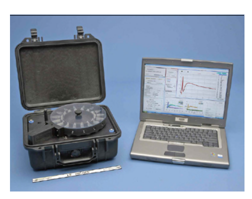
For liquid samples, the Laboratory developed a 16-channel sensor that processes ~100 samples in an hour. This unit has higher throughput than that of any competing technology.

For further information, contact: Communications Office MIT Lincoln Laboratory 244 Wood Street Lexington, MA 02420-9108 781-981-4204