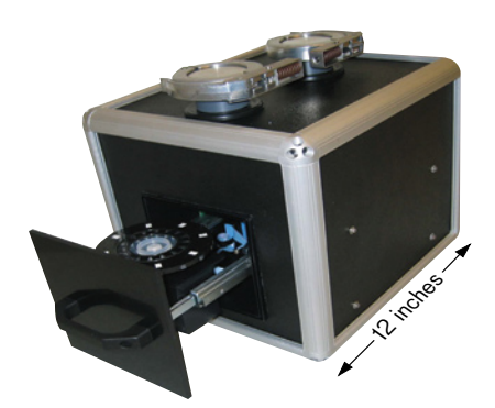
For aerosol samples, the 37 lb, 1 ft<sup>3</sup>, portable PANTHER sensor called CUB (for Compact Unit Biosensor) has shown identification of pathogens in a record time of <2 minutes, and its modest cost, less than $30,000, makes it viable for widespread biodefense use.