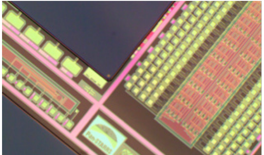
Optical micrograph of back-illuminated CCD wafer.

Our CCDs are used in ground, air, and space-based applications of interest to the government and scientific research community. These CCDs span a range of wavelengths including visible, near infrared, ultraviolet, and soft X-ray. Among imagers employing our CCDs are the two 1.4-billion-pixel Panoramic Survey Telescope and Rapid Response System's (Pan-STARRS) focal plane arrays, the largest focal planes fabricated to date, and the Space Surveillance Telescope's curved focal planes that provide a uniform and wide field of view.