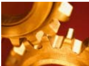
Figure 1: Conceptual diagram of System.

If figures are used, the figures should fit into the one-column width space. Figure captions (“Caption” style) should be set at Times 9 pt font, bold and centered below the figure as shown: