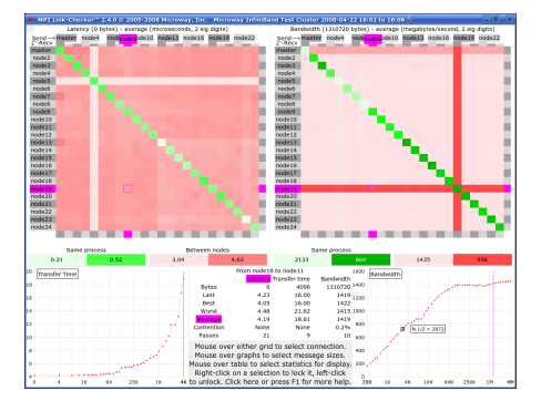
Figure 1: MPI Link-Checker<sup>TM</sup> shows latency and bandwidth.

In a Linux Cluster, application performance may be degraded by issues with the interconnect, such as loose cables or mismatched channel adapters. A maintenance tool like MPI Link-Checker<sup>TM</sup> can help in rapidly identifying and diagnosing system and network problems. Figure 1 shows an InfiniBand-based cluster with one reduced-bandwidth node (the darker + in the right-hand chart, corresponding to a single-data-rate HCA in a double-data-rate cluster) and one improved-latency node (the lighter + in the left-hand chart, corresponding to a low latency TriCom-X<sup>TM</sup> InfiniBand HCA).