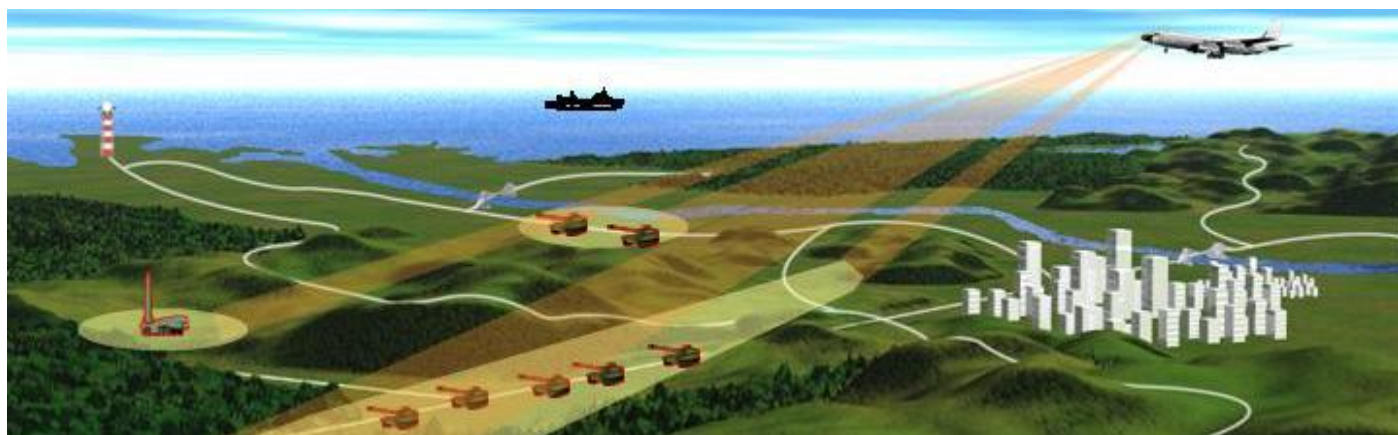
Fig. 1. A representative KASSPER problem.

A top level diagram of the KASSPER architecture is shown in Fig. 2. The components of this architecture that are different from a conventional radar signal processor are the knowledge database, knowledge cache, and the look-ahead scheduler.